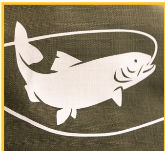
CAD-CUT® Heat Transfer Vinyl