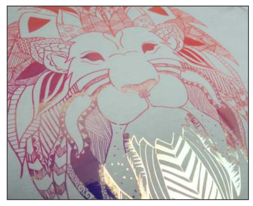
Neon Rainbow Orange BCHAM-NR-24

* Brilliant colors will not stretch or layer. These can be sublimated. These are not opaque and the effect will change, depending on your garment color. (see back page for more pictures) Please lint roll your garment prior to pressing.