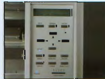
Convenient front panel makes it easy to adjust blade force, cutting speed and origin point. It also stores cutting conditions for up to eight pre-set jobs.

Roland reserves the right to make changes in specifications, materials or accessories without notice. Your actual output may vary. For optimum output quality, periodic maintenance to critical components may be required. Please contact your Roland dealer for details. No guarantee or warranty is implied other than expressly stated. Roland shall not be liable for any incidental or consequential damages, whether foreseeable or not, caused by defects in such products. All trademarks are the property of their respective owners.