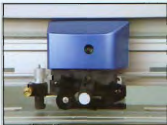
Powerful servomotors achieve maximum accuracy and cutting speeds up to 33-inches per second.