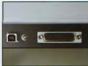
Easy access USB and serial ports make connectivity a snap.